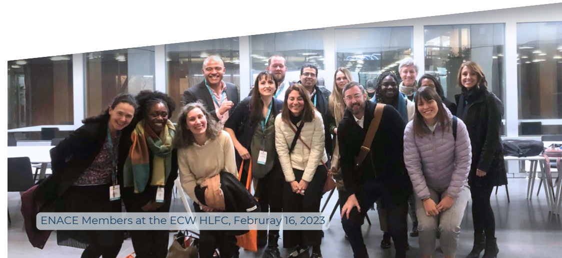
ENACE Members at the ECW HLFC, February 16, 2023

2 institutional members and 6 individual members that wish to remain anonymous