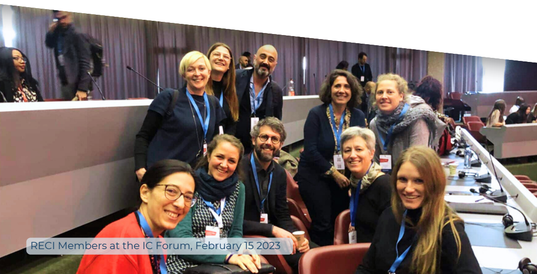
RECI Members at the IC Forum, February 15 2023

In 2023, RECI was deeply engaged in advocacy efforts: apart from strategic discussions on how RECI could position itself in national and international advocacy discussions on education and international cooperation, we have seized two opportunities for joint advocacy activities. RECI organised the European and North American regional event of the Global Action Week for Education (see p.18). In addition, RECI led on the elaboration of a joint position paper in response to the consultation on the draft Swiss strategy for international cooperation 2025-2028, which was submitted on behalf of RECI members and the Board (see p.19)